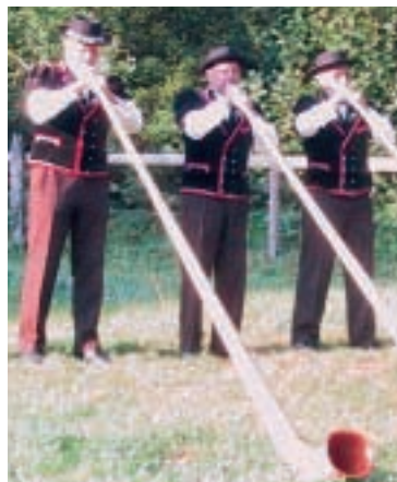
The traditional Swiss Alphorns