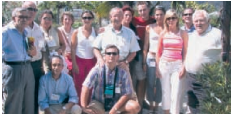
The "Spanish Connection" in the middle of the Garden Paradise Schwitser, Inwil