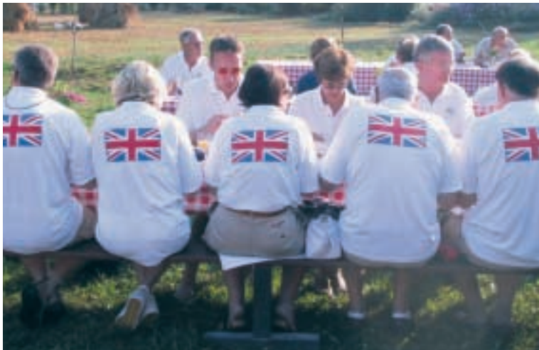
The perfect English Breakfast !

still one of the most important and innovative operations in Switzerland.