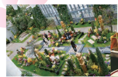
Awaji Yumebutai Park