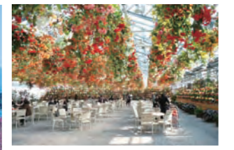
Nabana no Sato Park